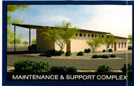
MAINTENANCE & SUPPORT COMPLEX