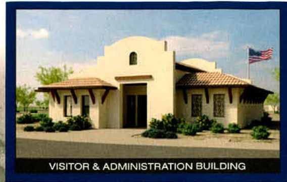
VISITOR & ADMINISTRATION BUILDING